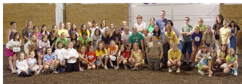
Nearly 125 youth in attendance.

The level of excitement was on high as youth started to arrive at the second national youth llama/alpaca show held in June in central Indiana. The three-day All American Jamboree, offering shows, workshops, seminars, challenges, and fun events, was open to all llama youth participating in any 4-H llama group or any ALSA youth member. Youth attending represented eleven different states.