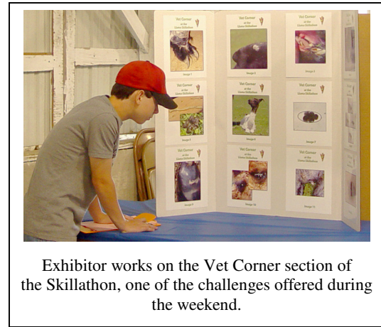
Exhibitor works on the Vet Corner section of the Skillathon, one of the challenges offered during the weekend.

Another favorite activity of the weekend was the Llama Jeopardy. All youth were divided into teams of mixed ages so skill levels evened out. Various elimination rounds were played until there was one group of three Llama Jeopardy winners. The winning team members from this final round each received large gift baskets full of assorted items.