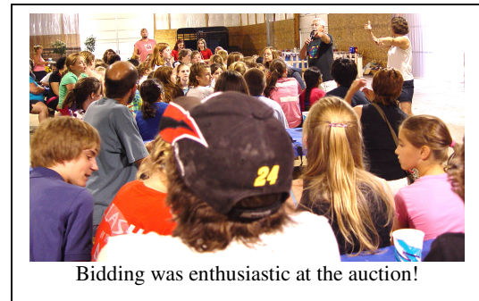
Bidding was enthusiastic at the auction!

The Youth Jamboree was the "bargain of the year" with only a $50 fee for the entire weekend. Shows, stalling, workshops, two dinners, and two breakfasts were all included in the one fee! A pizza party was held on Friday night followed by a live auction with over 100 items for the kids to bid on with the "Llama Bucks" they found in their show packet. Additional "Llama Bucks" were handed out throughout the day from "Jamboree Mystery Bankers" who watched for good workers, groomers, meeting new friends, and those helping their fellow exhibitors.